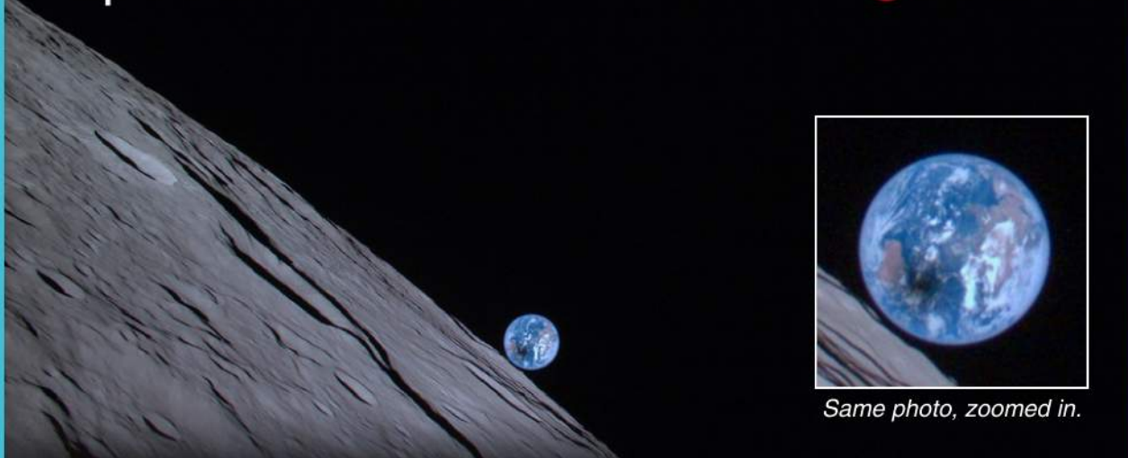
Same photo, zoomed in.